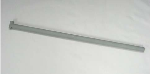
031-300-050-321 Mounting pole

PAT SENSOR ASSY, WINDSPEED PRS35 HARDWIRED