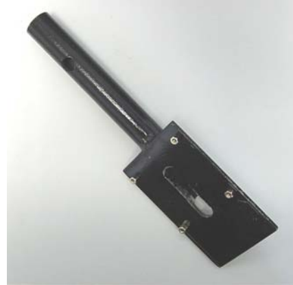
031-300-050-480 Anemometer mounting plate