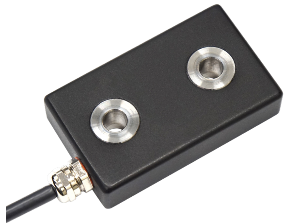
IMD-150-238 load cell

WIKA Mobile Control's IMD-150-238 load cells are designed especially for telehandlers. With durable design and protection rating IP66/67, this sensor is perfectly equipped for operation under harsh conditions.